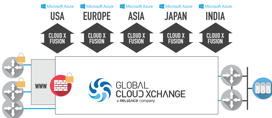
Benefit from up to 100 times faster throughput (at up to 10 Gbps) when accessing Microsoft Azure via CLOUD X Fusion and ExpressRoute

the Azure services are in the USA, Europe or Asia, CLOUD X Fusion provides enterprise-grade connectivity from anywhere in the world over a private global MPLS network backed by performance SLAs. Now, Azure users anywhere can benefit from improved network reliability, performance and security; even those whose "last mile" access is over the Internet.